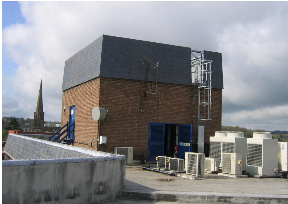
Telecoms equipment hidden behind GRP screen on upper roof

Design, co-ordination and planning submission of a RF transparent GRP concealment - London